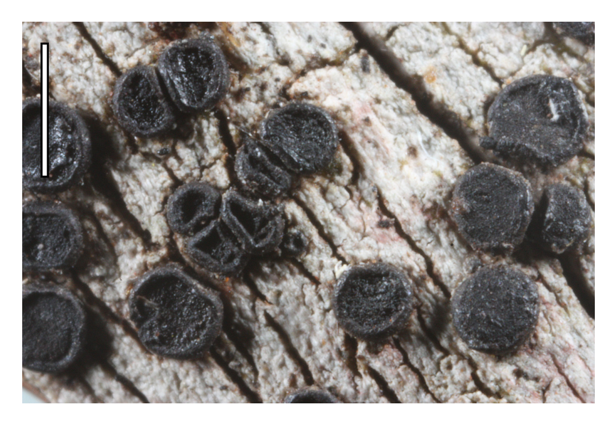
Fig. 3. Cratiria verdonii (holotype). Scale: 1 mm.

Specimens examined: Australia: Queensland: Darling Downs: Bunya Mountains State Forest, 46 km S of Kingaroy, 26°48'13''S, 151°33'44''E, alt. 765 m, on dead wood in mixed Eucalyptus-Araucaria forest, J.A. Elix 38639 , 7 May 2005 (CANB). New South Wales: North Coast (Jacobs and Pickard 1981): Mount Boss State Forest, Cockerawombeeba Creek, 46 km NW of Wauchope, 31°15'S, 152°20'E, alt. 700 m, on branches of Sloanea in Geissosis benthamii-Sloanea australis closed forest, D. Verdon 4073 , 21 October 1978 (CANB).